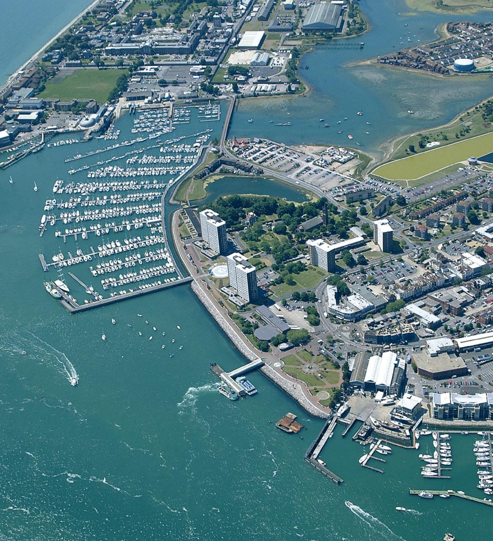
Gosport waterfront, Portsmouth Harbour