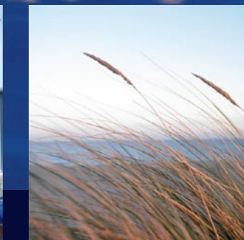
Environmental and legislative advice