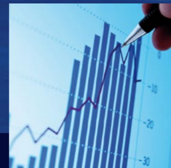
Feasibility studies and market research